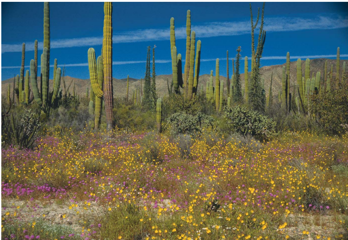
The Vizcaino subdivision of the Sonoran Desert is on the Pacific side of the Baja California peninsula. Though rainfall is very low, cool, humid sea breezes with frequent fog ameliorate the aridity. This subdivision contains some of the most bizarre plants and eerily beautiful landscapes in the world.